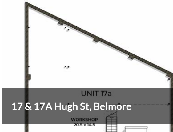
UNIT 17a 17 & 17A Hugh St, Belmore