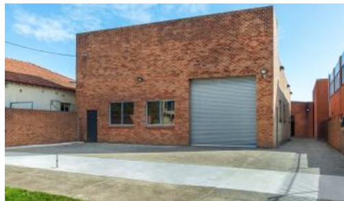
WORKSHOP 20.5 x 14.5